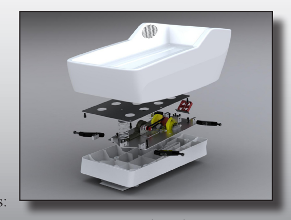
Work with engineers to develop product specifications and new product concepts