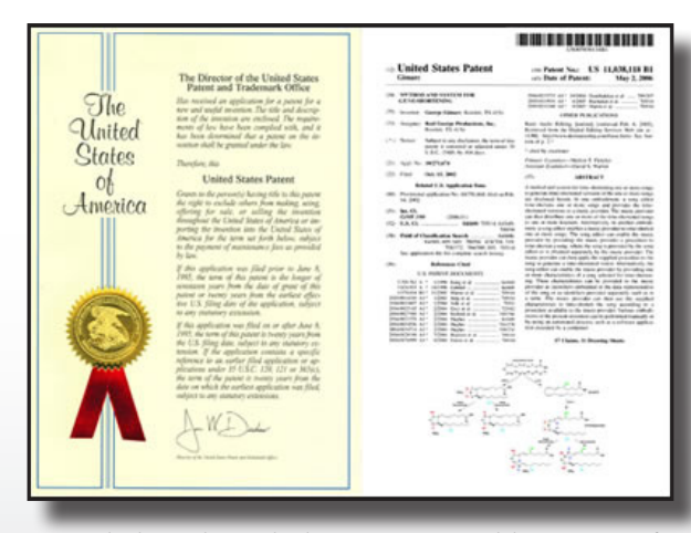
Work directly with the creation and licensing of patents and other intellectual property

Attend trade shows to market and promote a diverse range of products