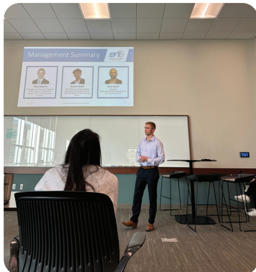
Pitch and Pizza